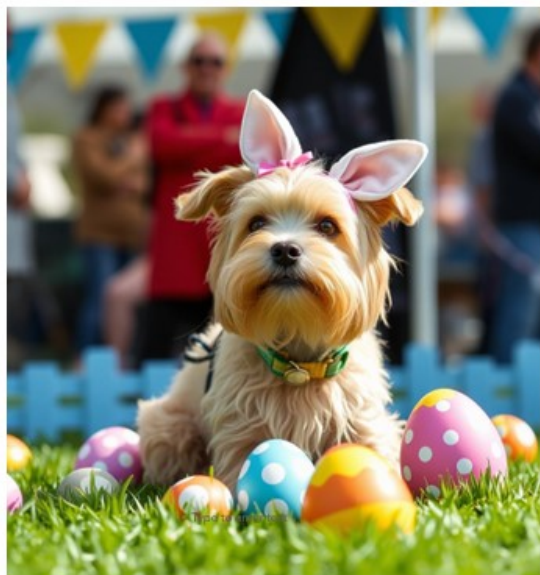
MILTON ABBAS DOG SHOW Saturday, 19 April 2025

Milton Abbas Cricket and Sports Field, Milton Abbas, Dorset DT11 0BB